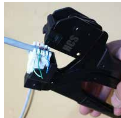
Insert the jack into the guide