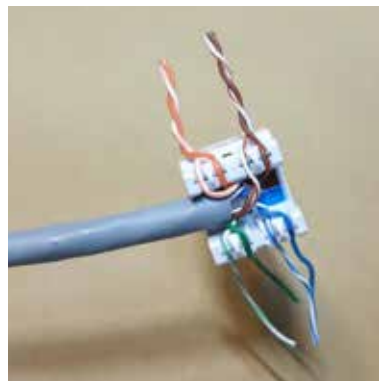
Press the wires through the slots